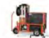
HOT-WATER PRESSURE WASHERS