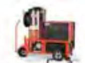
HOT-WATER PRESSURE WASHERS

P/N 8.914-178.0 Effective 9/07 Specifications and product descriptions subject to change without notice. ©2007 Hotsy