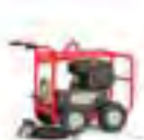
COLD-WATER PRESSURE WASHERS